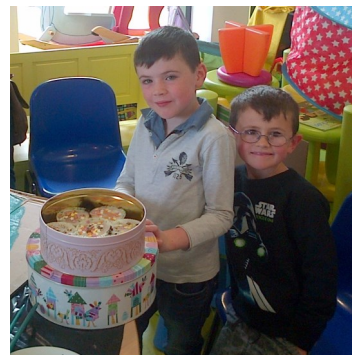
we liked the result ... :)